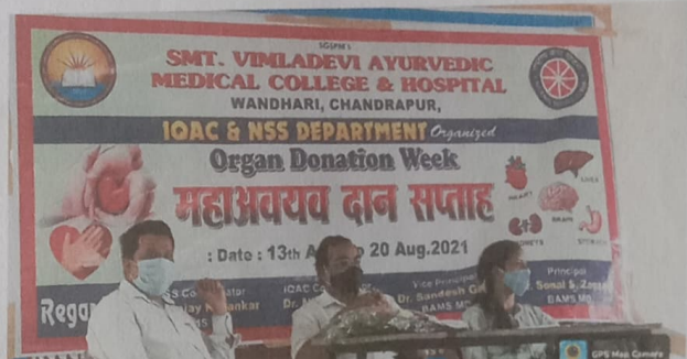
Wandhari, Maharashtra, India X6M5+JVJ, Wandhari, Maharashtra 442406, India Lat 19.984002° Long 79.210243° 18/08/21 02:38 PM