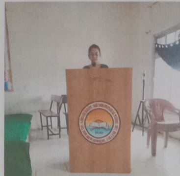
Wandhari, Maharashtra, India X6M5+JVJ, Wandhari, Maharashtra 442406, India Lat 19.984205° Long 79.209267° 18/08/21 02:28 PM