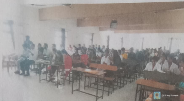
Wandhari, Maharashtra, India X6M5+JVJ, Wandhari, Maharashtra 442406, India Lat 19.984077° Long 79.20943° 18/08/21 02:35 PM