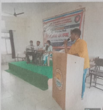
Wandhari, Maharashtra, India X6M5+JVJ, Wandhari, Maharashtra 442406, India Lat 19.984135° Long 79.209384° 18/08/21 02:32 PM