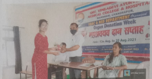
Wandhari, Maharashtra, India X6M5+JVJ, Wandhari, Maharashtra 442406, India Lat 19.984205° Long 79.209294° 18/08/21 02:27 PM