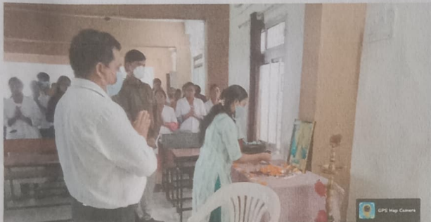
Wandhari, Maharashtra, India X6M5+JVJ, Wandhari, Maharashtra 442406, India Lat 19.984178° Long 79.209266° 18/08/21 02:26 PM