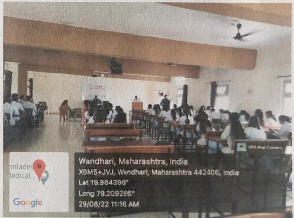
Wandhari, Maharashtra, India X6M5+JVJ, Wandhari, Maharashtra 442406, India Lat 19.984398° Long 79.209286° 29/08/22 11:16 AM