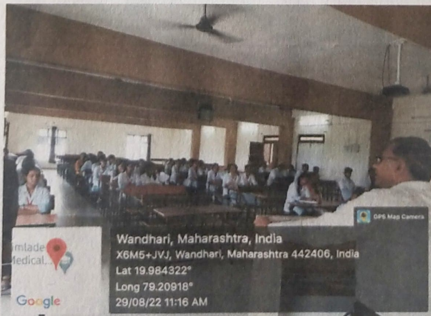
Wandhari, Maharashtra, India X6M5+JVJ, Wandhari, Maharashtra 442406, India Lat 19.984322° Long 79.20918° 29/08/22 11:16 AM