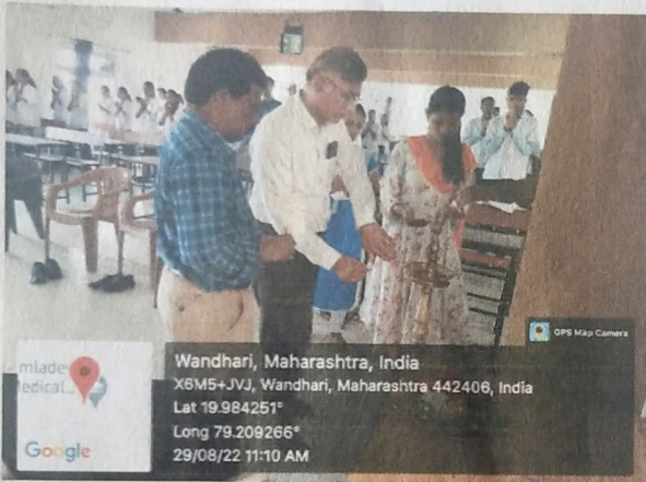
Wandhari, Maharashtra, India X6M5+JVJ, Wandhari, Maharashtra 442406, India Lat 19.984251° Long 79.209266° 29/08/22 11:10 AM