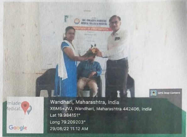
Wandhari, Maharashtra, India X6M5+JVJ, Wandhari, Maharashtra 442406, India Lat 19.984151° Long 79.209203° 29/08/22 11:12 AM