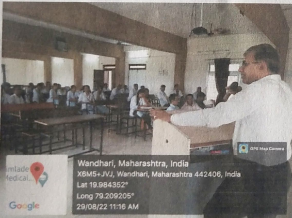
Wandhari, Maharashtra, India X6M5+JVJ, Wandhari, Maharashtra 442406, India Lat 19.984352° Long 79.209205° 29/08/22 11:16 AM